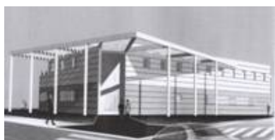
Model of the Institute's future building

An applied research (based on phenomenology), the development of innovative methods for risk assessment and crisis management are the main pillars of the Major Risk Institute (MRI).