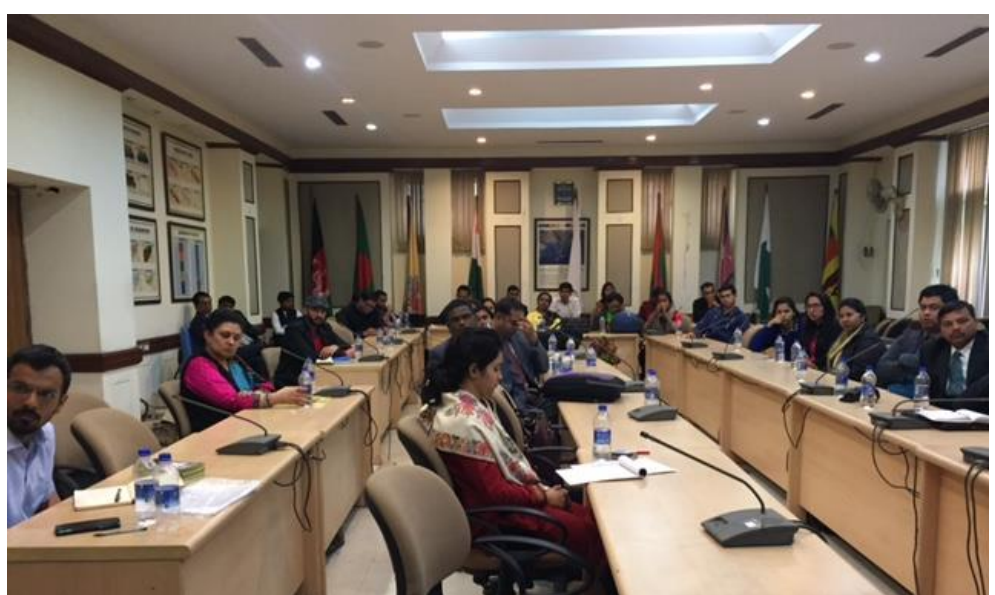
A session in progress at the Workshop on Higher Education in Disaster Management: Challenges & Opportunities, February 10, 2017, New Delhi

We are building a response and relief crowdsourcing portal that can proactively reach out to 100M+ online audience via a network of outreach partners (websites & apps) for 4-5 days in the aftermath of a disaster - to crowd-source response and relief resources for India's leading response agencies - be it, finances, goods, or volunteers.