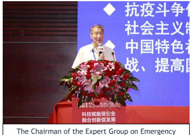
Management under the State Council, the Deputy Director of the Expert Committee of the State Disaster Reduction Commission, and the president of China Chapter of TIEMS

With the theme of "Innovating Science and Technology Security and Promoting the Development of the Bay Area Together ", the conference invited experts and scholars in the field of emergency management, such as the expert committee of the National Disaster Reduction Commission, the Chinese Academy of Engineering, the Chinese Academy of Sciences. the China Chapter of The International Emergency Management Society (TIEMS) and scientific research institutes of colleges and universities, and invited experts, scholars, departments and government industry representatives from both China and abroad in the field of emergency management and emergency industry to attend the conference.