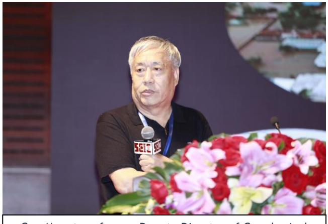
Gao Mengtan, former Deputy Director of Geophysical Research Institute of China Earthquake Administration (CEA)

conference The also organized an exhibition on emergency products, inviting more than 600 well-known enterprises and institutions to focus on the display of emergency materials and equipment in the fields of fire-fighting, communications, unmanned rescue, public epidemic prevention, police equipment, natural disasters, urban safety, popular science education, and so on, with an area of about 15000 square meters.