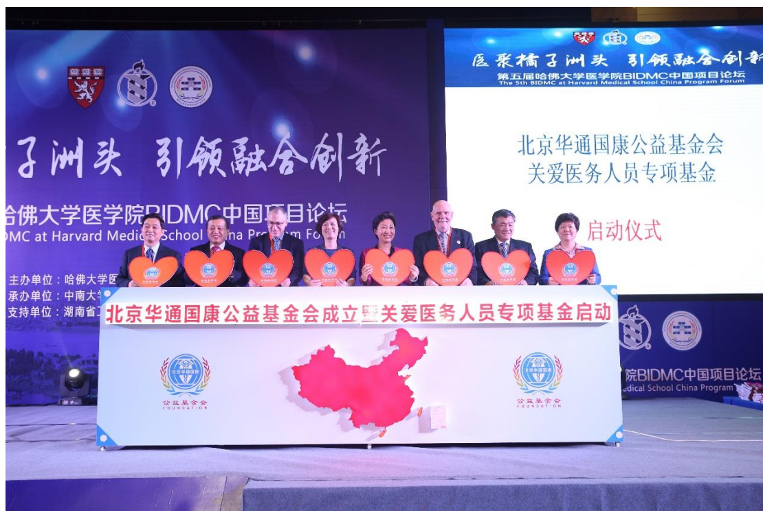
Beijing Huatong Guokang Foundation Namely Care for Medical Workers Specialized Fund Launch Ceremony