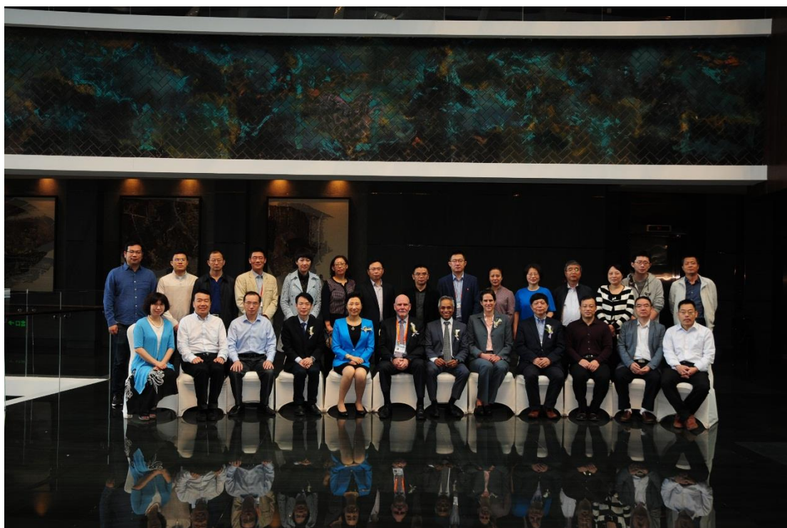
The Cardiologists Sub-Forum Group photo