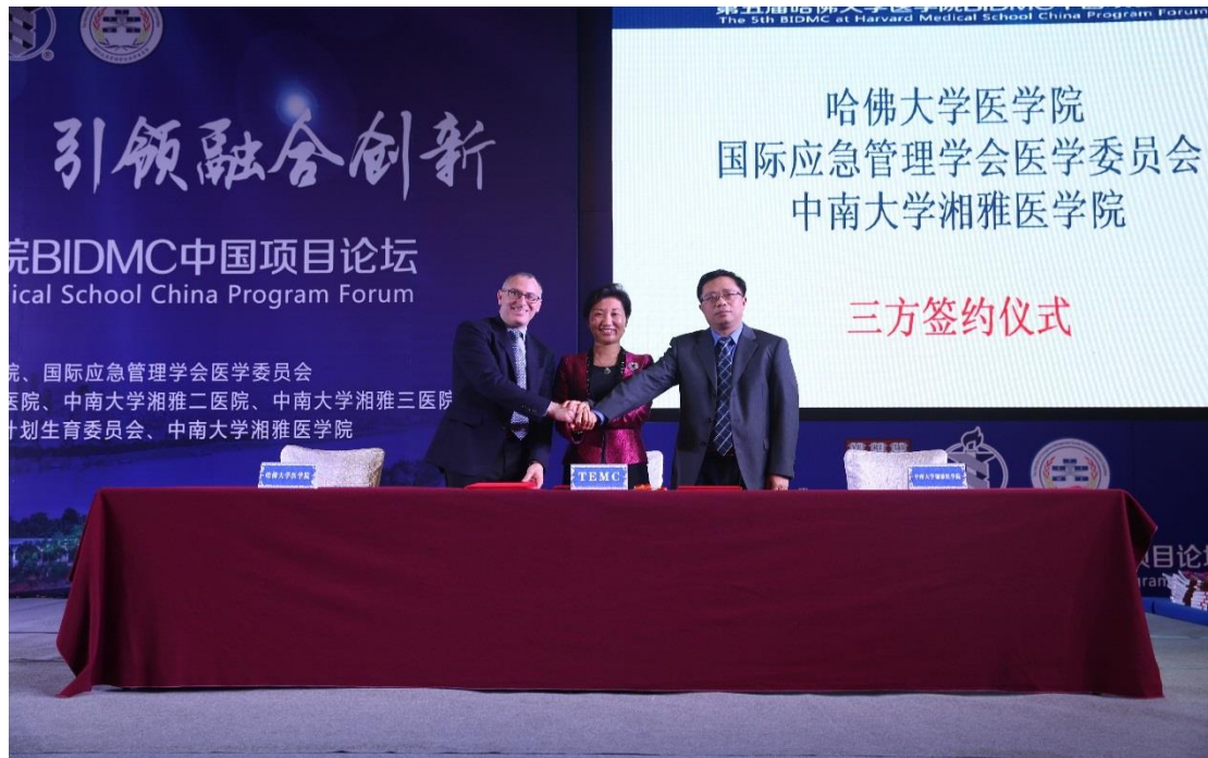
HMS, TEMC and XiangYa Medical School of Central South University signed the tripartite cooperation agreements