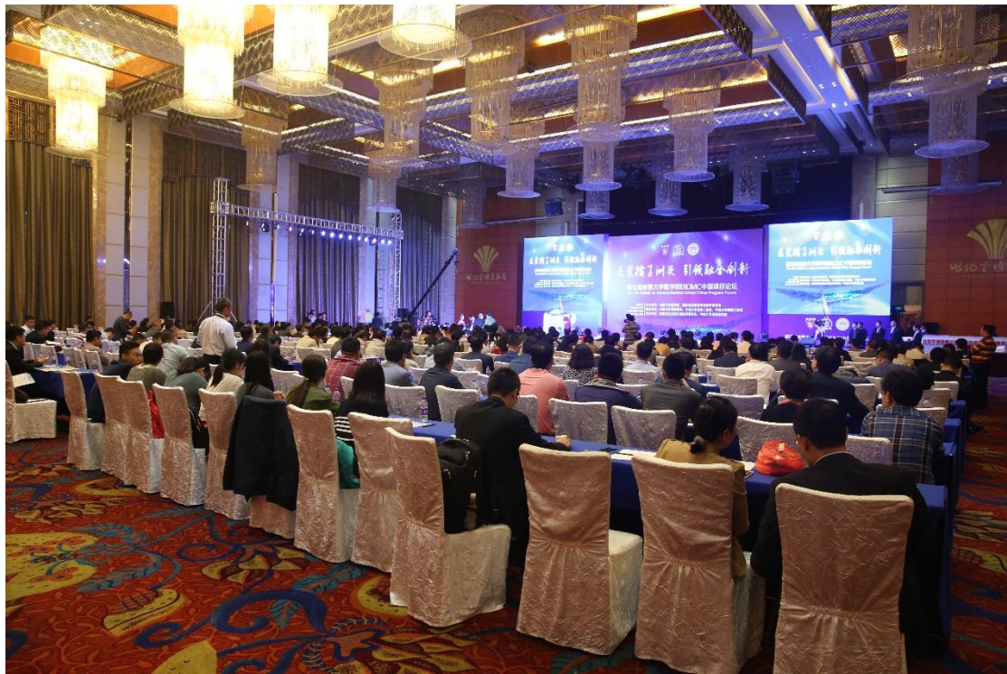
Forum conference scene