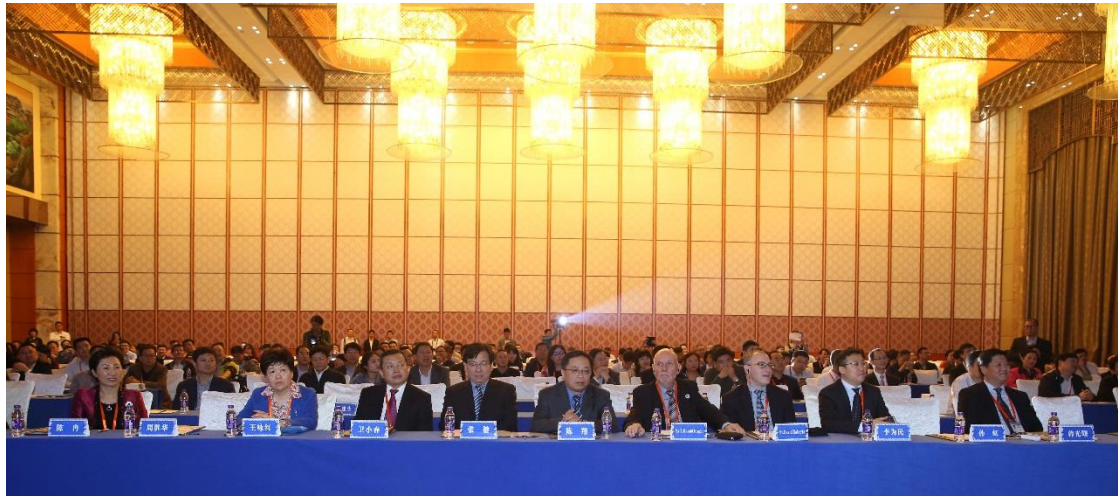
Forum conference scene