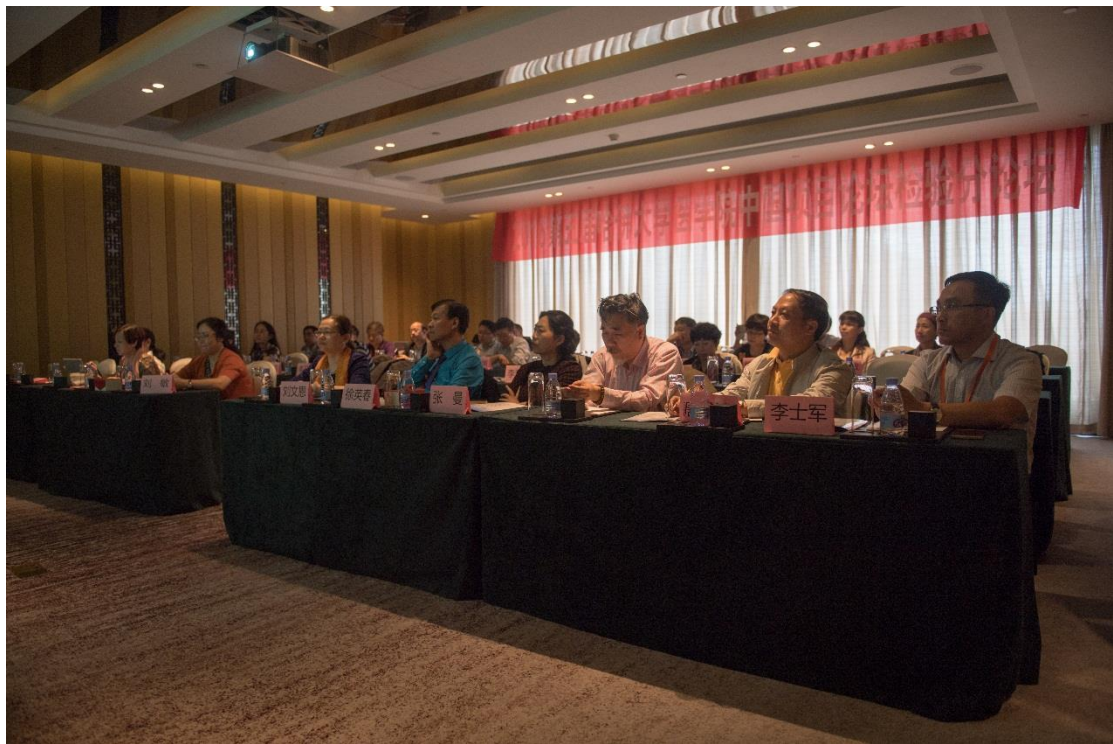
The Clinical Laboratory Sub-Forum