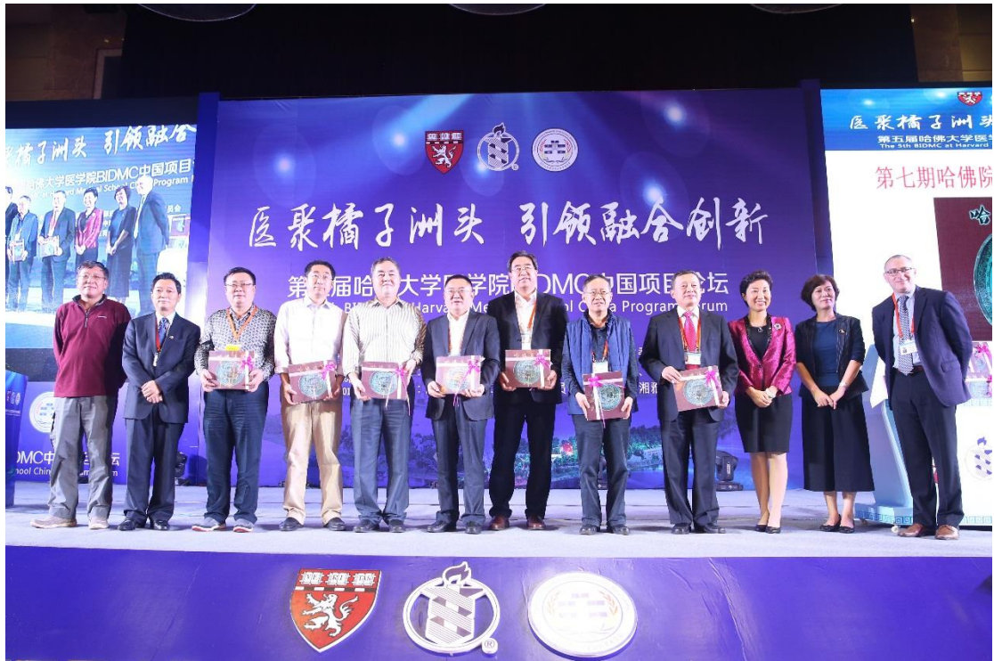
Album of Harvard Release Ceremony