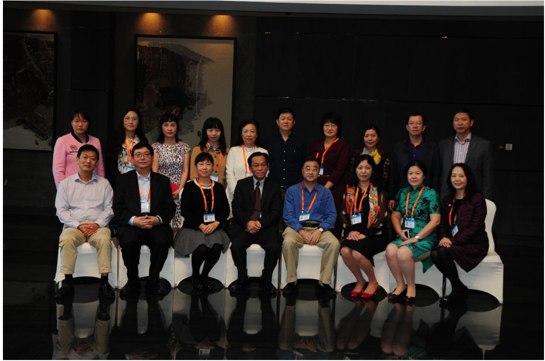
The Oncologists Sub-Forum Group photo