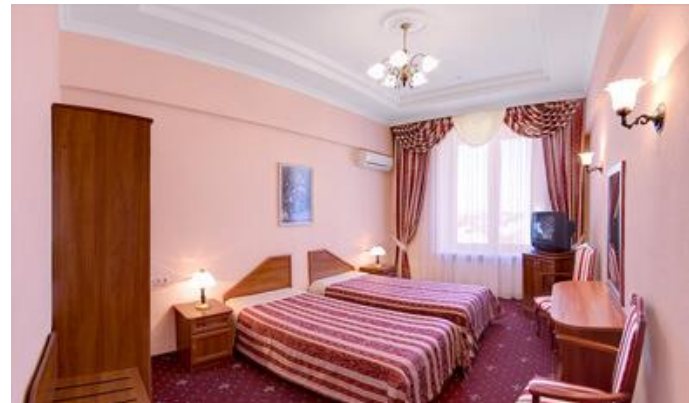
standard twin bed (two separate single beds)