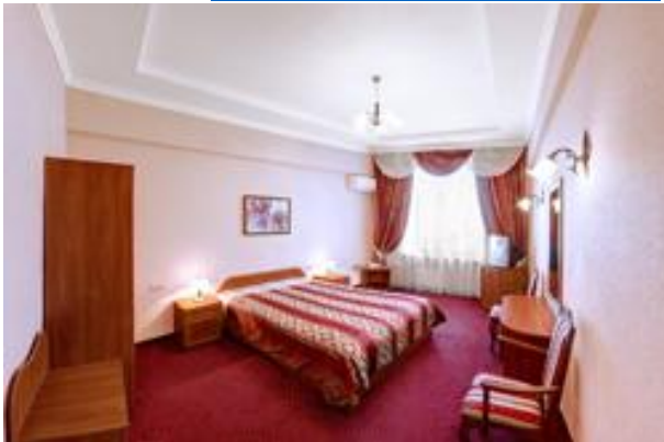
standard double (King size bed)

We look forward to welcoming you to TIEMS Annual conference 2017. In order to help with your planning, a number of rooms have been blocked in hotel "Ukraine" in Kiev. Hotel rooms are available in different room and price categories for conference delegates: 40 standard double (King size bed) (about 50 EUR/night) and 10 standard twin bed (two separate single beds) (about 60 EUR/night). Hotel website: http://ukraine-hotel.kiev.ua/en .