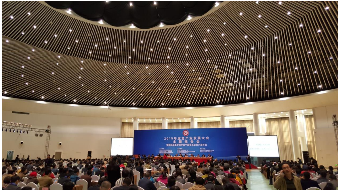
The Opening session of the Sixth Annual Conference of TIEMS China Chapter