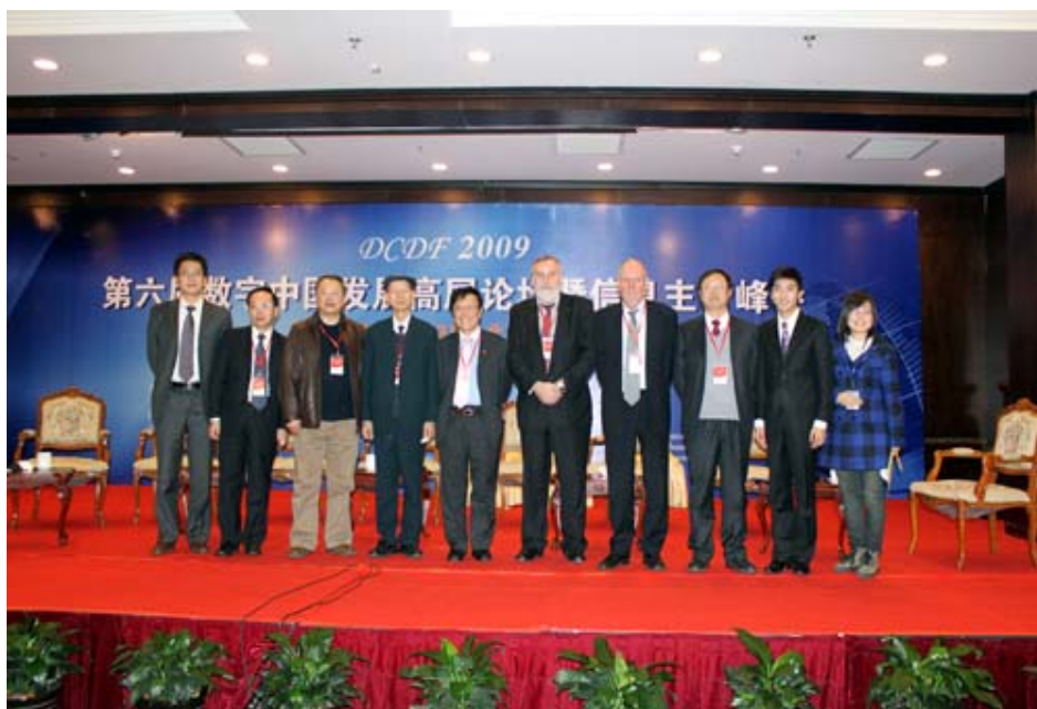
(Pic.9: Group Photo at DCDF 2009)

On December 12 th -13 th , TCC co-sponsored another workshop — “The 6th Digital China Development Forum (DCDF2009)”. A total of four hundreds of government officials, renowned academicians, experts and researchers, famous entrepreneurs coming from countries all over the world took part in this senior workshop in Beijing Zhongyuan Hotel. The topics covered by