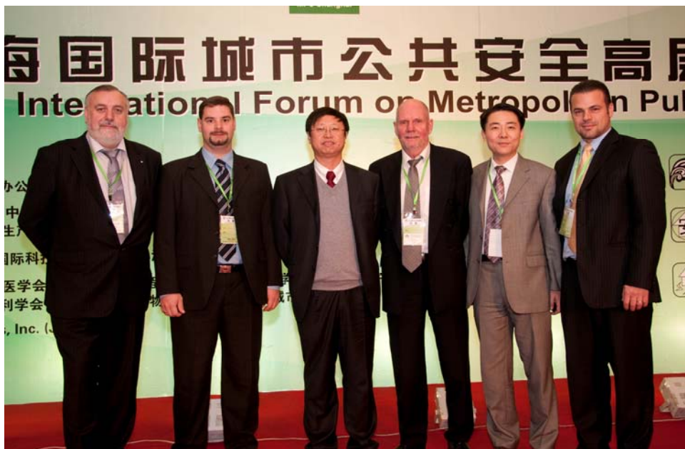
(Pic.2: TIEMS Delegates in Shanghai Forum)