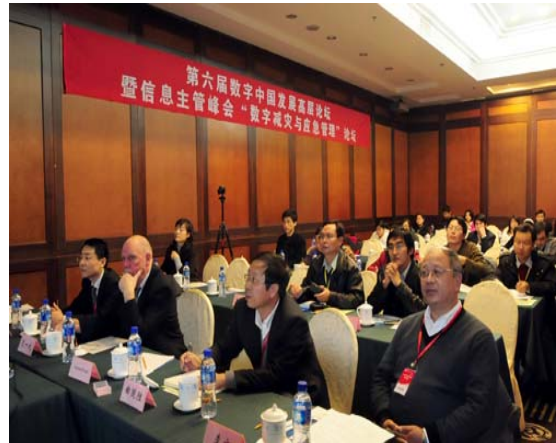
(Pic.10: Group Photo at DCDF 2009)