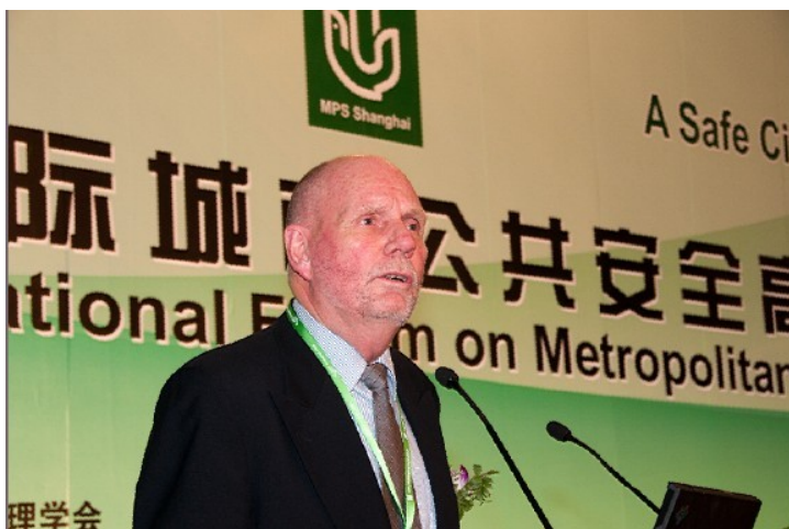
(Pic.3: TIEMS President, K. Harald Drager)

The forum covered a wide range of topics including disaster prevention, emergency command communication, disaster disposal, rescue and guarantee, and relief construction, which made it actually an exhibition of the latest achievements of Chinese government in emergency prevention, disaster rescue and disaster reduction.