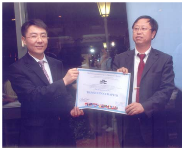
(Pic.1: TIEMS China Chapter Foundation)

Since its foundation in this June, besides the accomplishments in scientific research and communication and publication, TCC mainly focuses its attention on the preparation of TIEMS 17th Annual Conference in Beijing. After serious discussions on board meeting, supported by TIEMS headquarter, TCC decided to arrange two senior workshops as the warm-up activities of the 17 th Annual Conference: