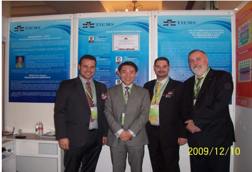
(Pic.8: Group photo at TIEMS Exhibition Booth)